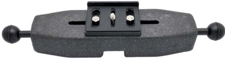
Float Stay 2260