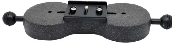
Float Stay 2296