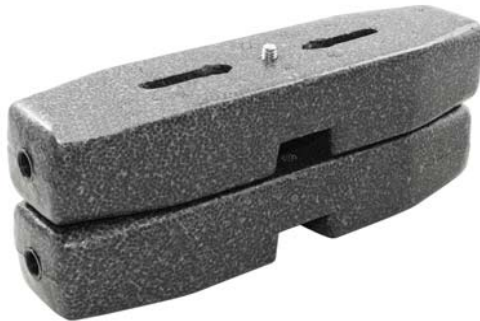
Float Stay 226080