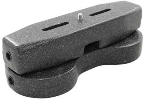
Float Stay 229670

These stays have threads at both ends where optional BJ Ball M10 can be attached.