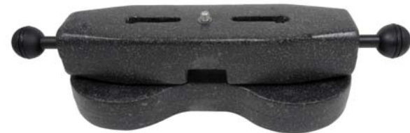
+0.8kg Float Stays with optional BJ Ball M10 attached