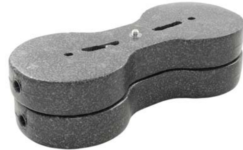
Float Stay 229660